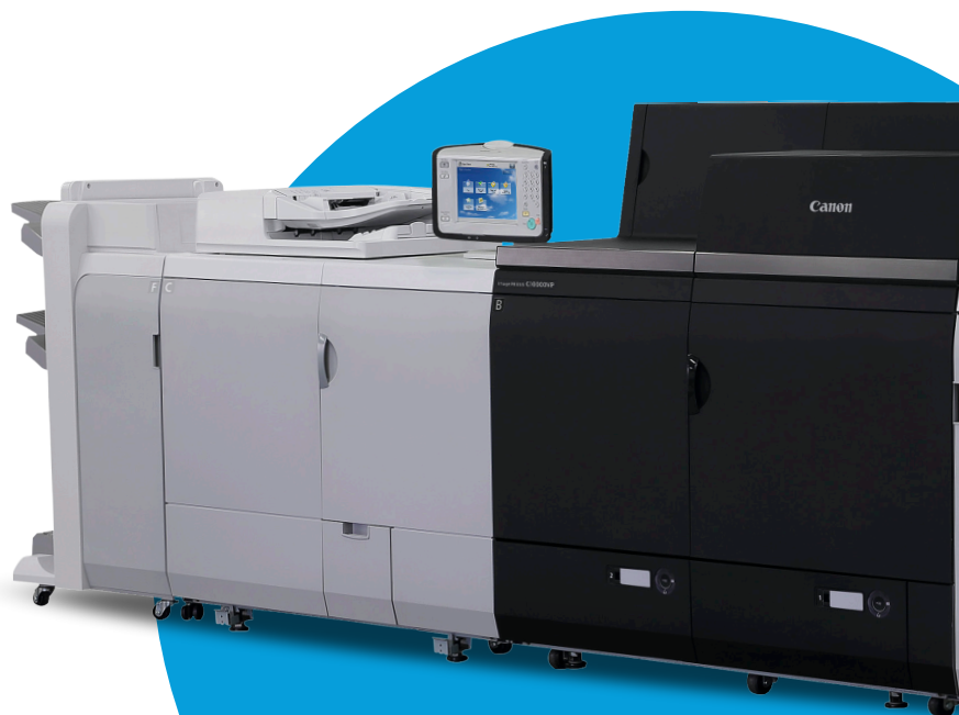
Pictured: Canon imagePRESS C10000VP

In-line finishing options: Increase productivity thanks to a comprehensive choice of automated in-line finishing capabilities and compatibility with third-party in-line finishing devices. Booklet-making, perfect binding, high-capacity stacking, multiple folding are all available. A new professional puncher supports formats including SRA3, A3, A4R and A5. In-line creasing is available for the first time.