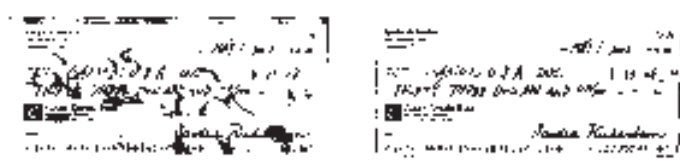
Advanced Text Enhancement OFF Advanced Text Enhancement ON

This scanning mode offers clearer black and white scans of cheques printed with illustrated or light coloured backgrounds. With normal scanning, such design elements may lead to images in which important information is obscured. By contrast, Canon's exclusive image processing technology detects where the letters on the page are and emphasises them for improved visibility.